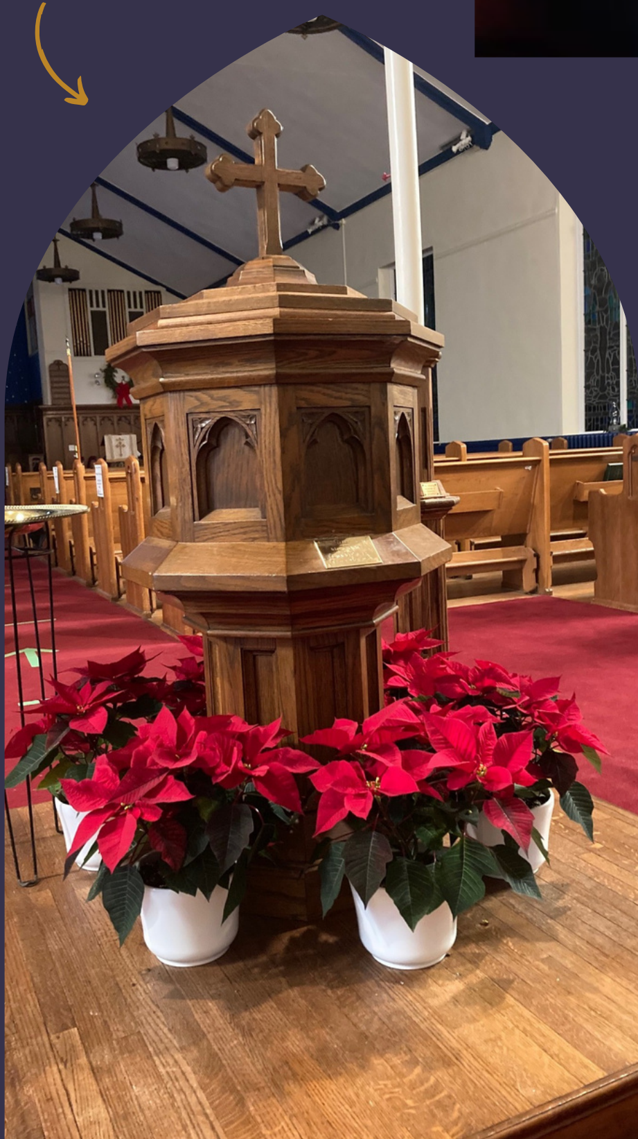
Decorations by the Chancel Guild